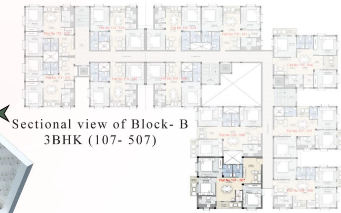
Sectional view of Block- B 3BHK (107- 507)