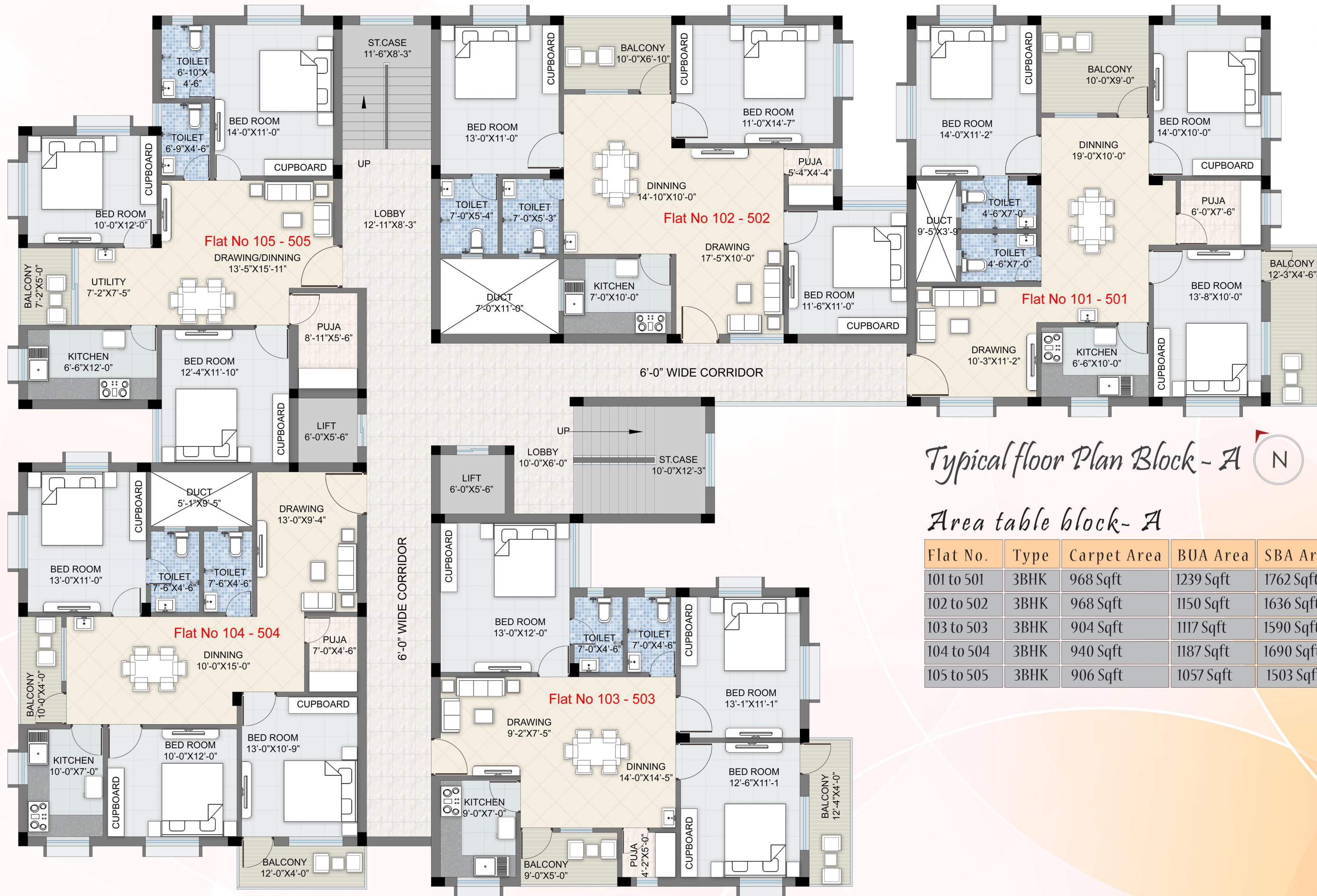
Typical floor Plan Block - A N