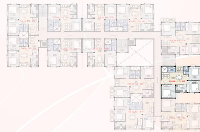
Sectional view of Block- B 3BHK (117- 517)