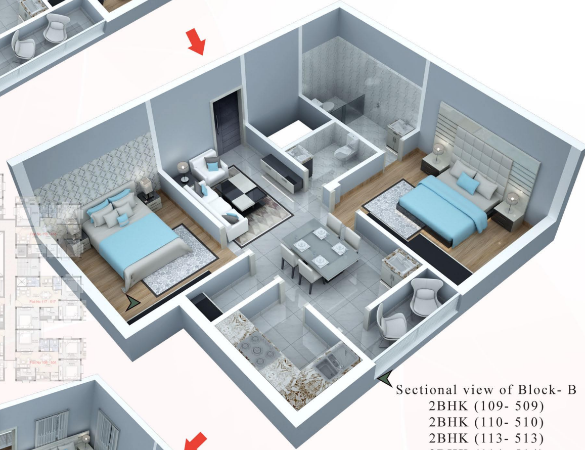
Sectional view of Block- B 2BHK (109- 509) 2BHK (110- 510) 2BHK (113- 513) 2BHK (114- 514)