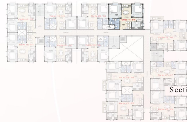
Sectional view of Block- B 3BHK (115- 515)